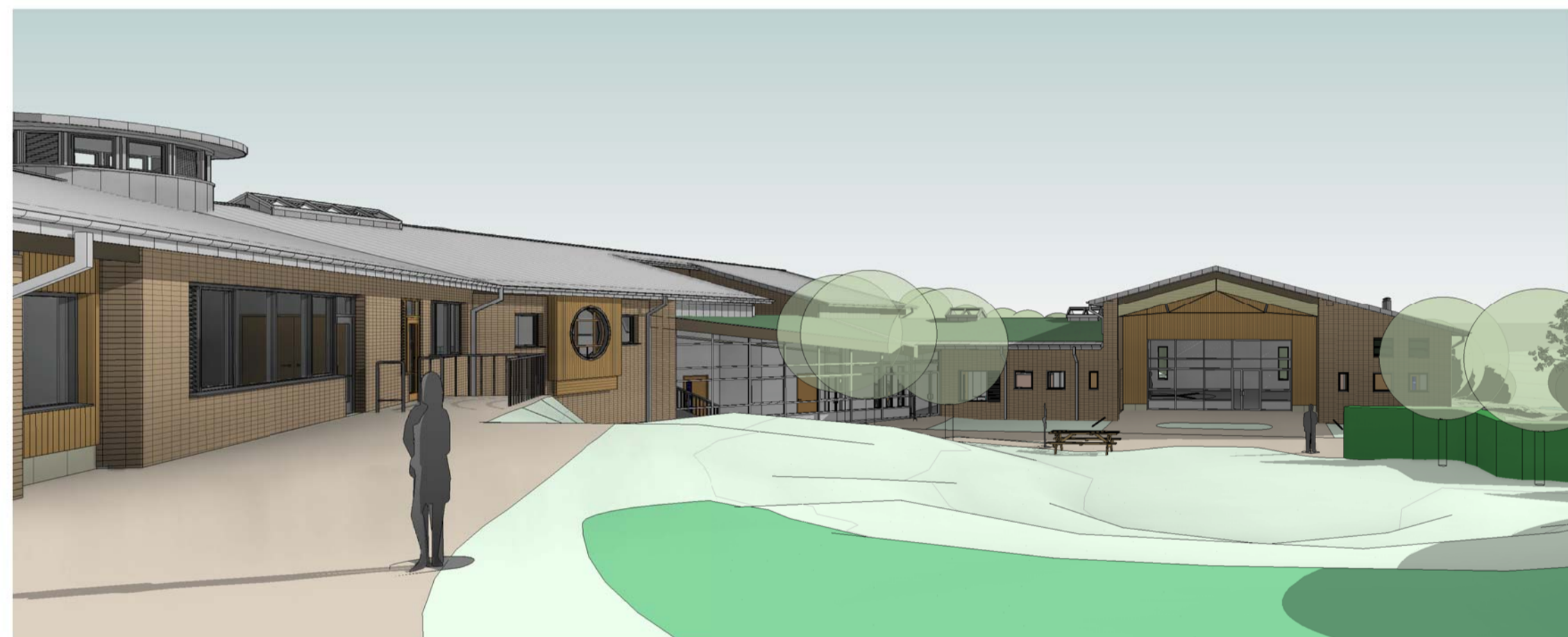
4 Top of amphitheatre