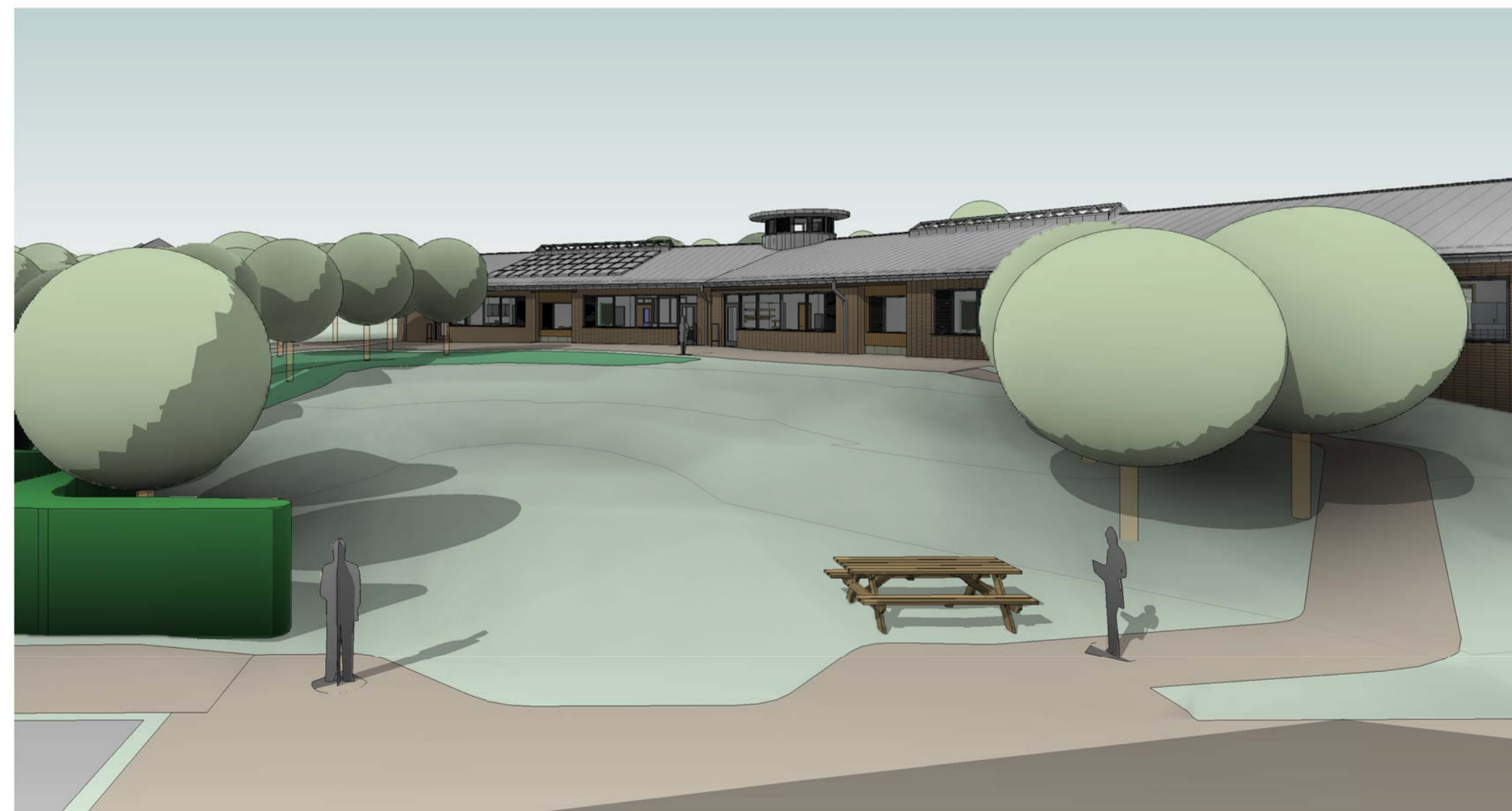
8 Amphitheatre from hall

Please note that these external views illustrate the overall form of the building rather than specific details.