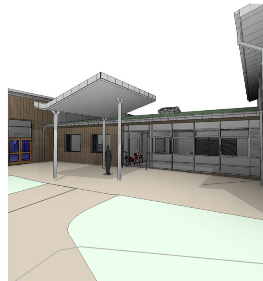
5 approach to main entrance