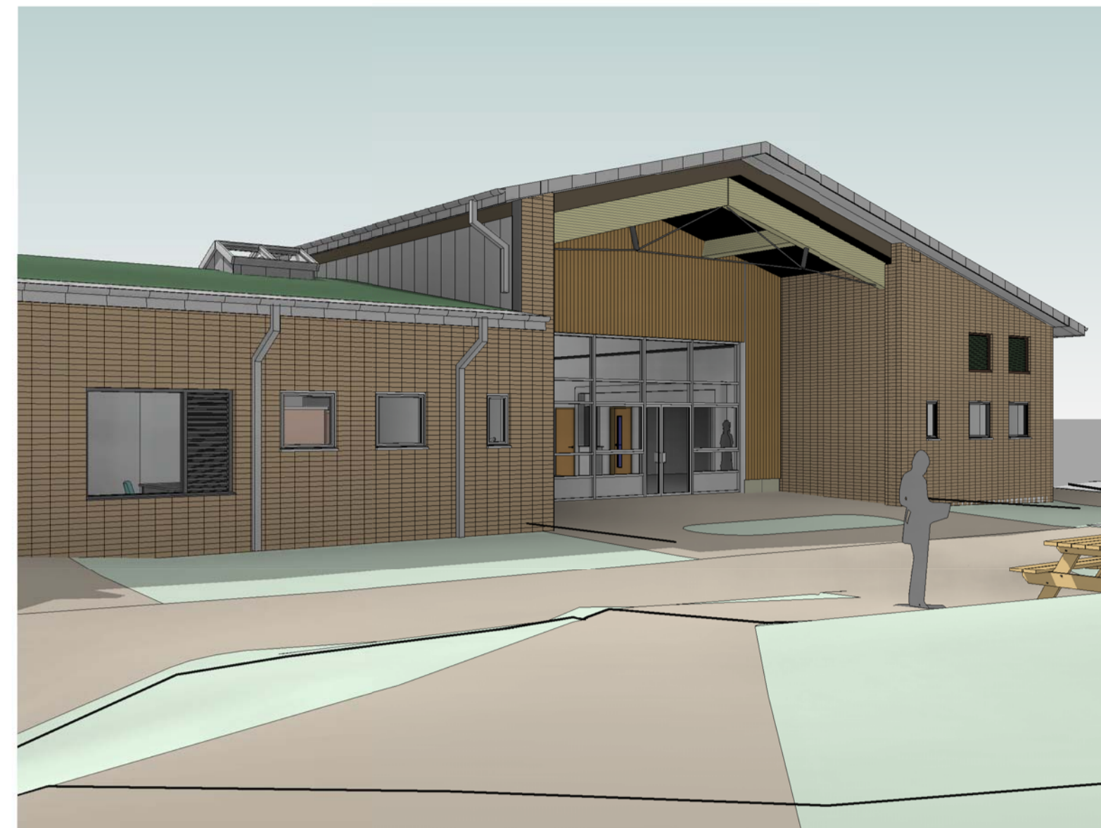
2 Hall exterior from north