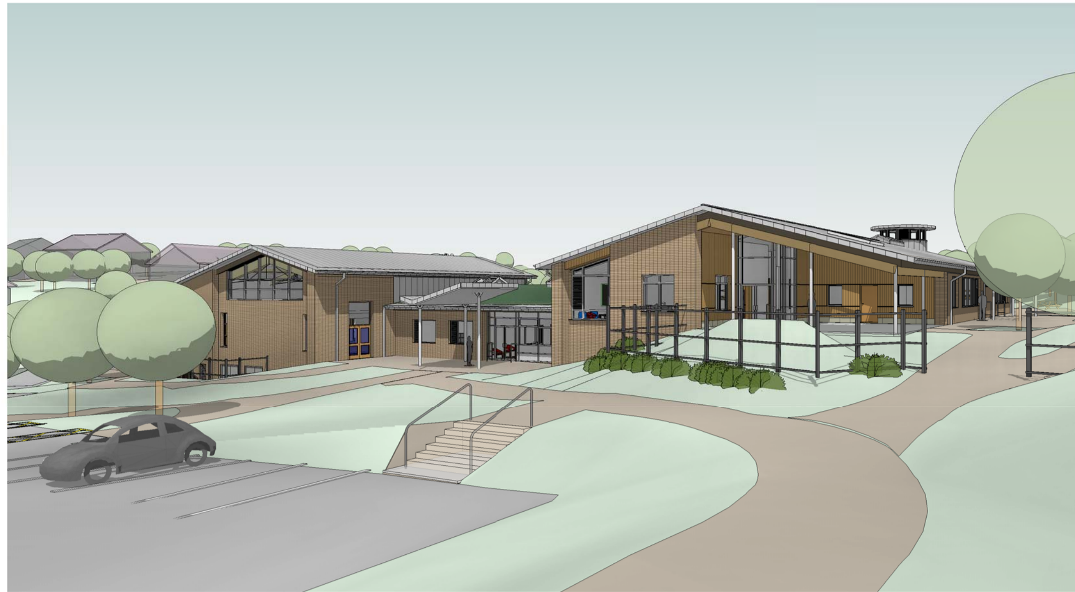
1 View from new pedestrian entrance