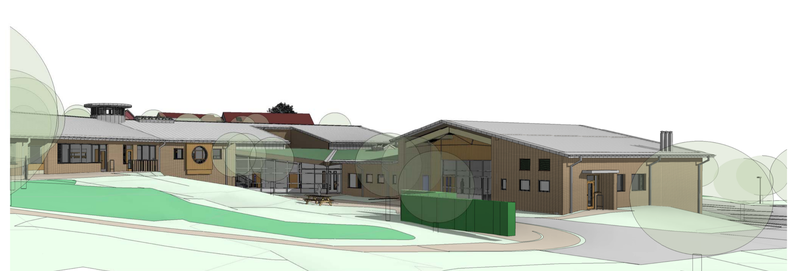
6 View from north west